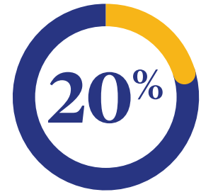
average retail gym membership savings with One Pass Select 3

Half of U.S. consumers report wellness as a top priority in their daily lives. 1 One Pass Select™ is designed to help make it easier for your employees to prioritize their health and wellness through a low-cost, extensive nationwide gym network, digital fitness and grocery delivery service. Best of all, your employees have the freedom to choose the option that fits their needs and lifestyle.